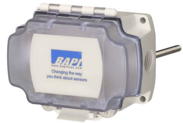
Wireless Duct Temperature Transmitter

BAPI Wireless Duct Temperature Transmitters feature medical-grade closed cell foam to seal the probe insertion hole and to absorb vibration. Mounting feet allow for easy installation directly to the wall of the duct. The Duct Units come with etched teflon leadwires, double encapsulated sensors and a watertight BAPI-Box enclosure to withstand high humidity and condensation and perform under real world conditions. The units are available with probe lengths from 4" to 18" to accommodate most duct shapes and sizes. Custom probe lengths are also available.